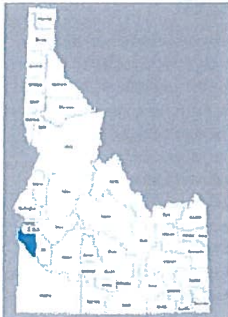
Canyon County Idaho

Performance Report July 1, 2017 – June 30, 2018