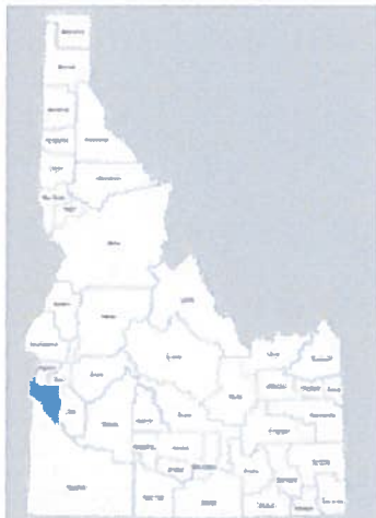
Canyon County Idaho

Performance Report July 1, 2016 – June 30, 2017