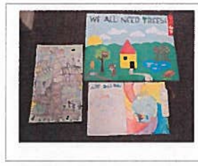
RIGHT –Notus Posters Winners

The Canyon SCD Outreach educates the landowners, public, and students in conservation awareness.