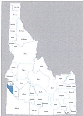
Canyon County Idaho

Performance Report July 1, 2018 – June 30, 2019