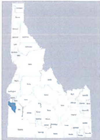
Canyon County Idaho

Performance Report July 1, 2021 – June 30, 2022