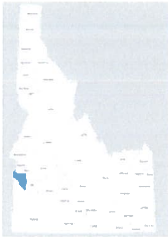
Canyon County Idaho

Performance Report July 1, 2020 – June 30, 2021