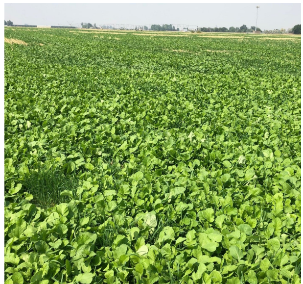
No-Till Drill - Radishes/Oats/Winter Peas Cover Crop Planted July 31, 2020

It can be used with a 70HP Tractor, and can be easily towed down the road with a heavy duty truck.